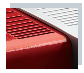
PEAK POUCH LAMINATING SYSTEMS