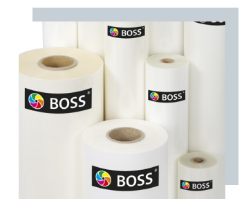
BOSS FILM SUPPLIES

Vivid design and manufacture a wide range of laminating systems, specialising in function, style and reliability.