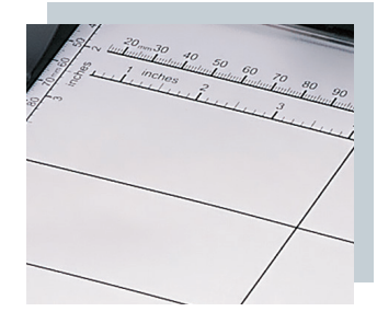
TRIMFAST TRIMMING & CUTTING SYSTEMS