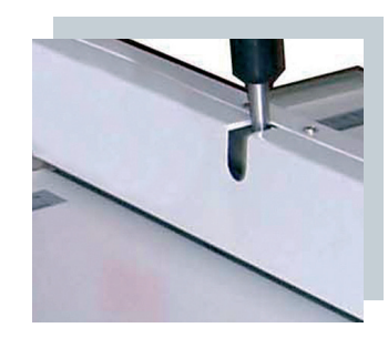
MAGNUM CREASING SYSTEMS